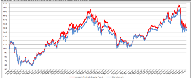
The graph represents gross of fees performance.